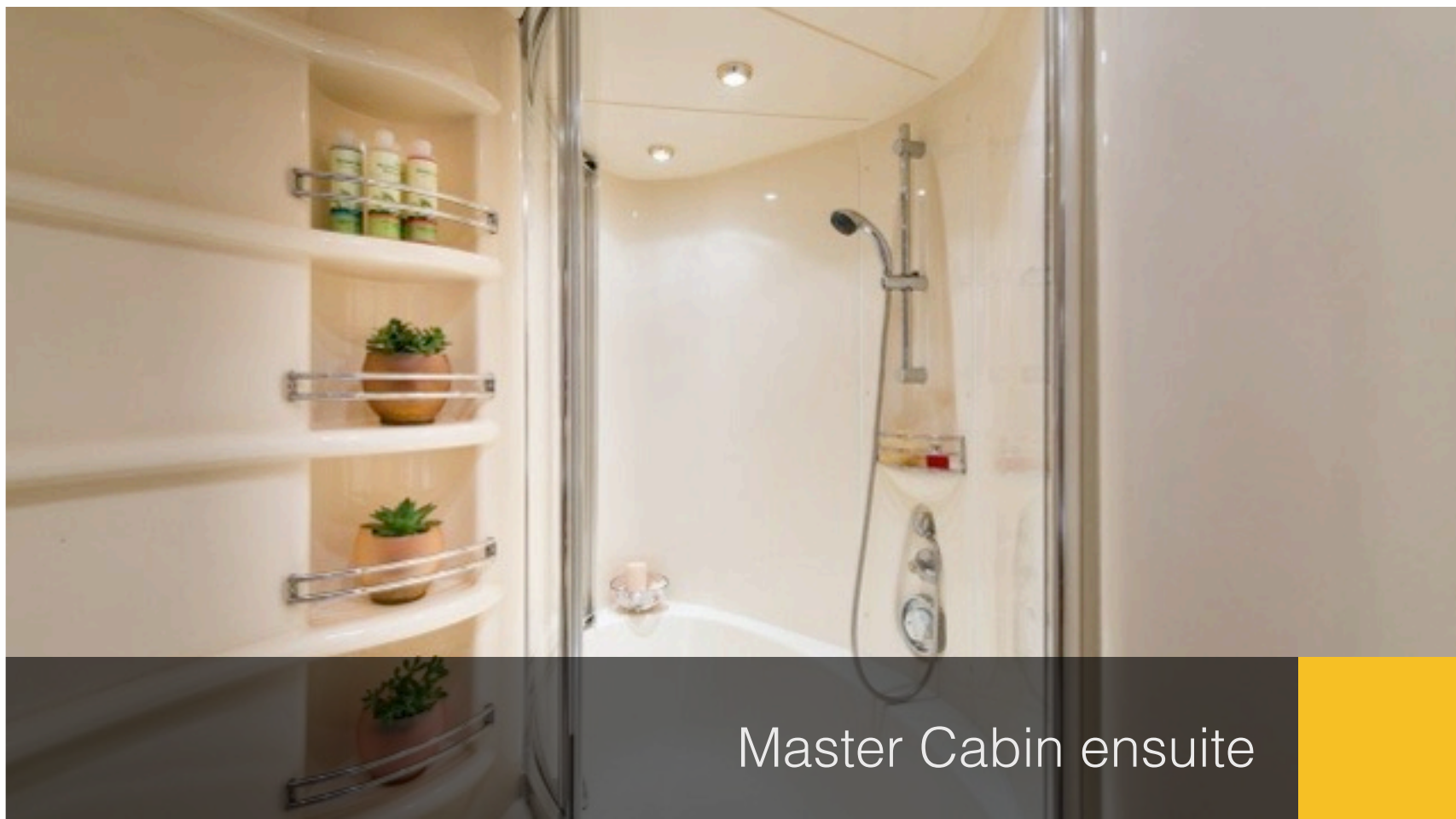
Master Cabin ensuite