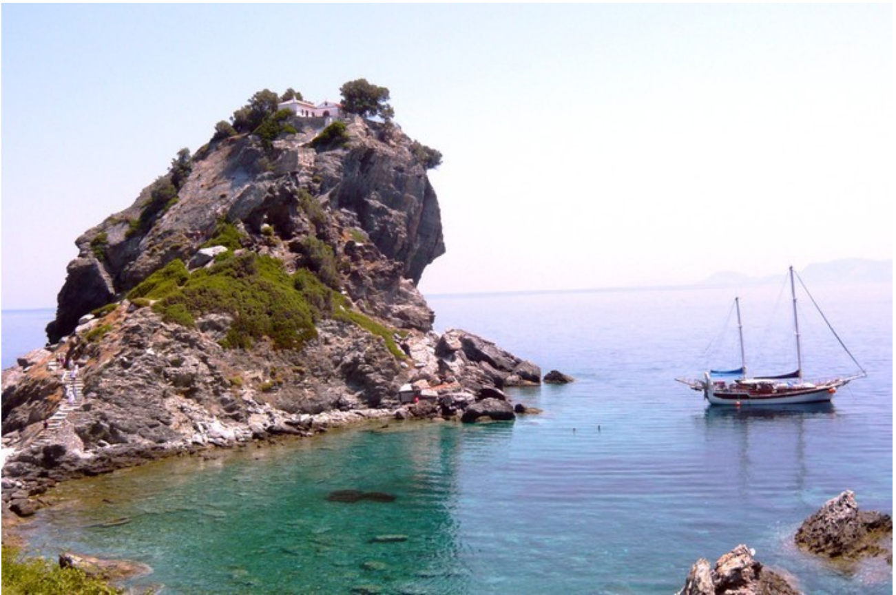
ANATOLIE on anchor under "Mamma mia" Church