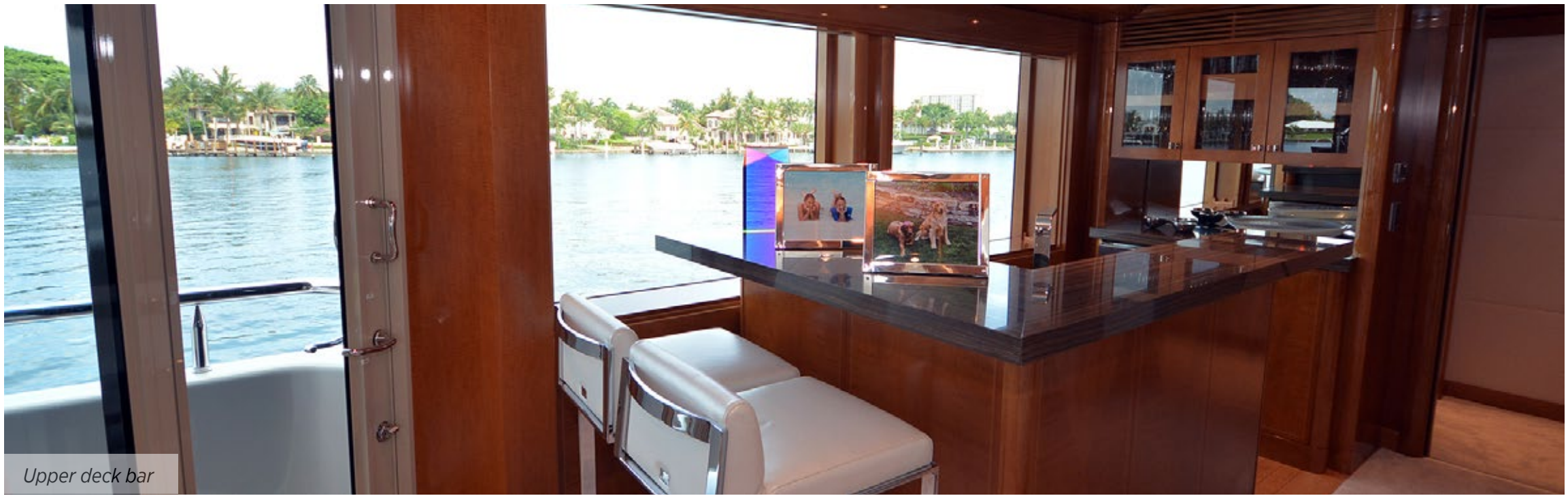
Upper deck bar