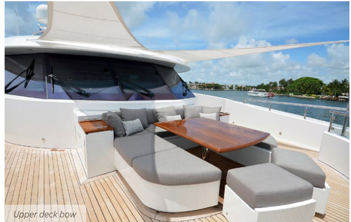
Upper deck bow