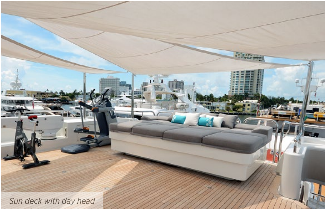
Sun deck with day head