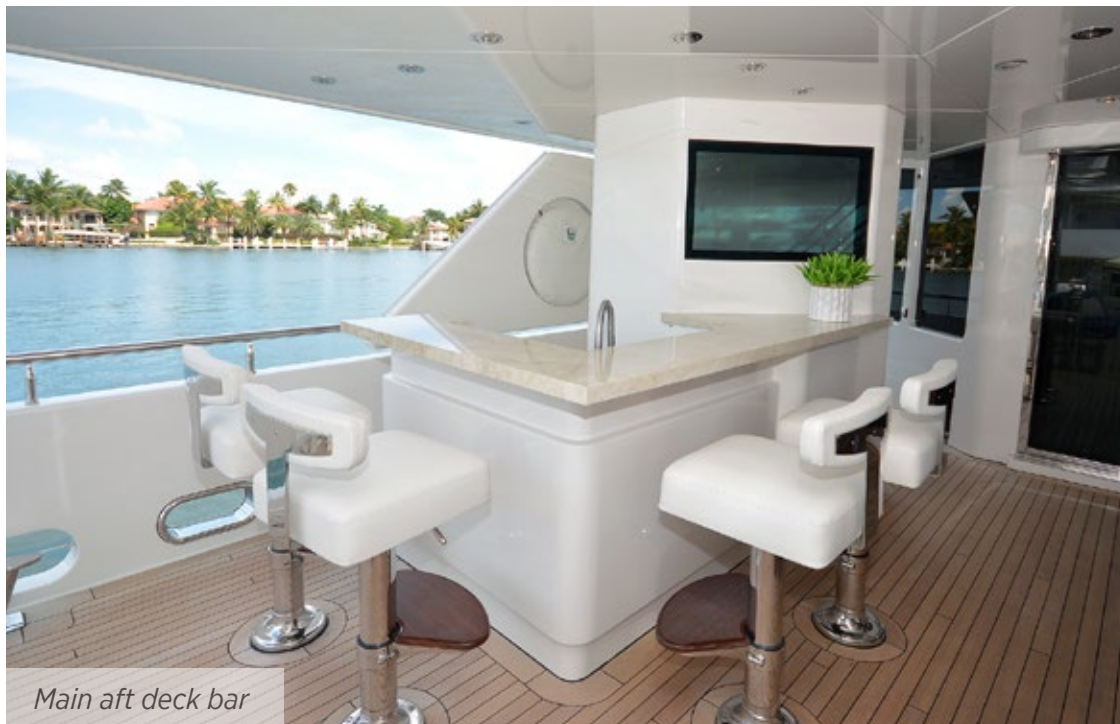
Main aft deck bar