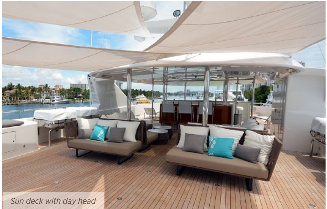
Sun deck with day head