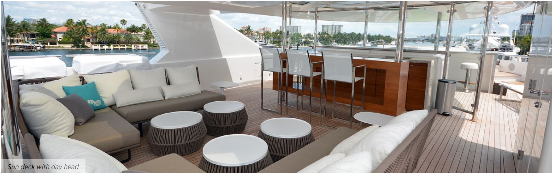
Sun deck with day head