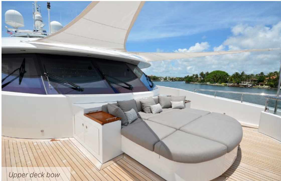
Upper deck bow