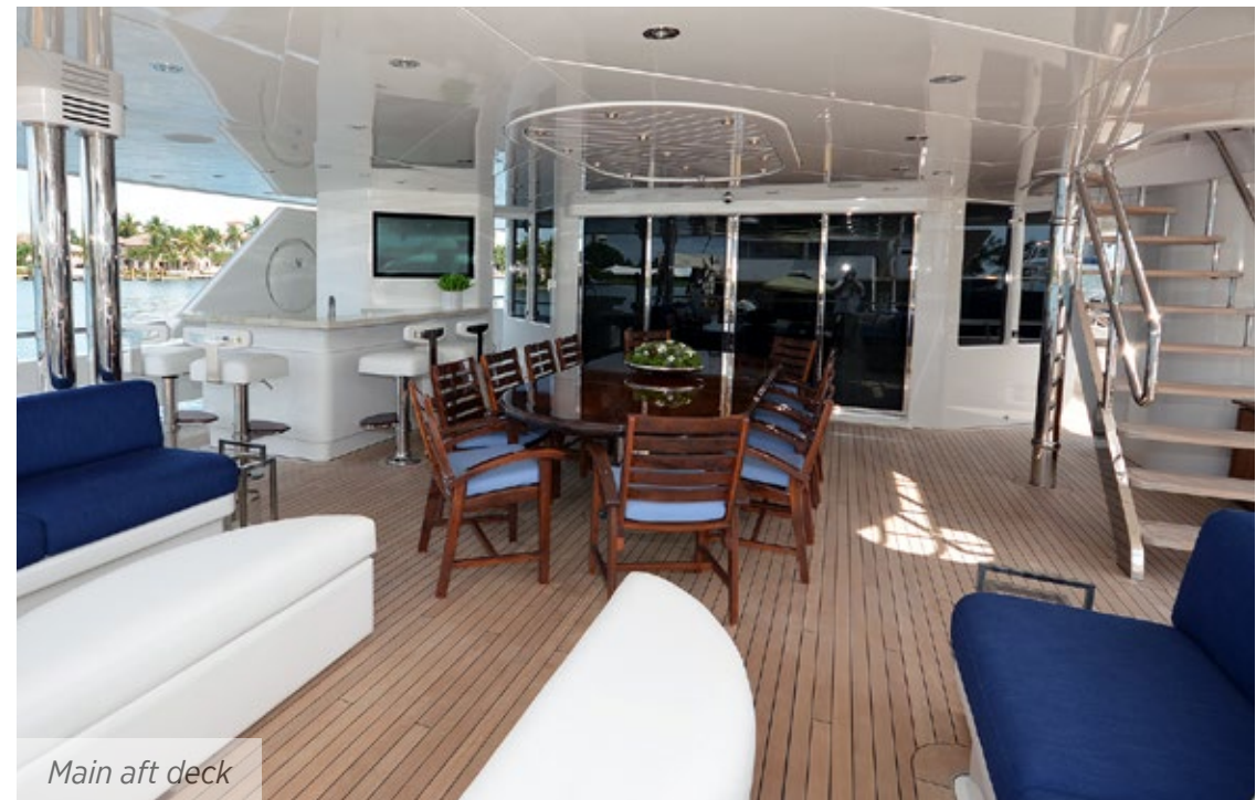
Main aft deck